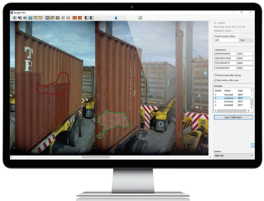
Visy's ADDS UI screen.

As the containers move into the exchange area, the frame cameras capture images of the long and short sides of each box. These images are also used for automatic data processing including box ID, ISO code, door direction, hazardous good labels, tare weight, seal presence, and damage detection. Before the