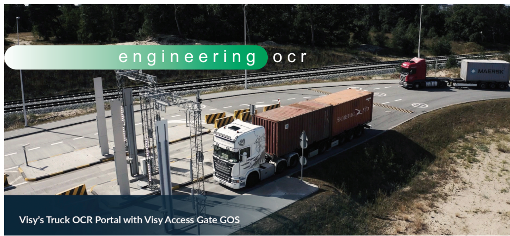
Visy's Truck OCR Portal with Visy Access Gate GOS